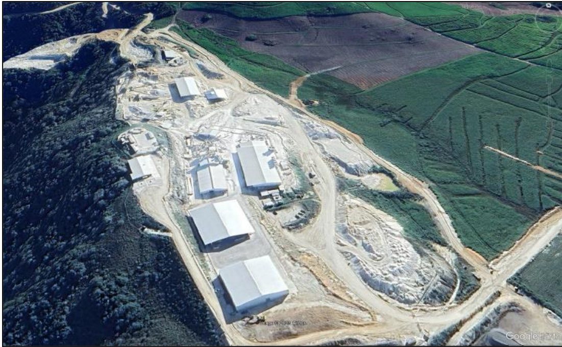
Figure 1: Aerial view of processing and packaging plant and mine offices

Although all the necessary approvals were in place for the mining and processing operation on Remainder and Sub 2 of Farm Westlands No 5829 ET, these did not include an area of the neighbouring property Remainder of Farm West Slopes No 5828 ET that had been excluded from designation as a biodiversity offset area. (see Figure 2 below)