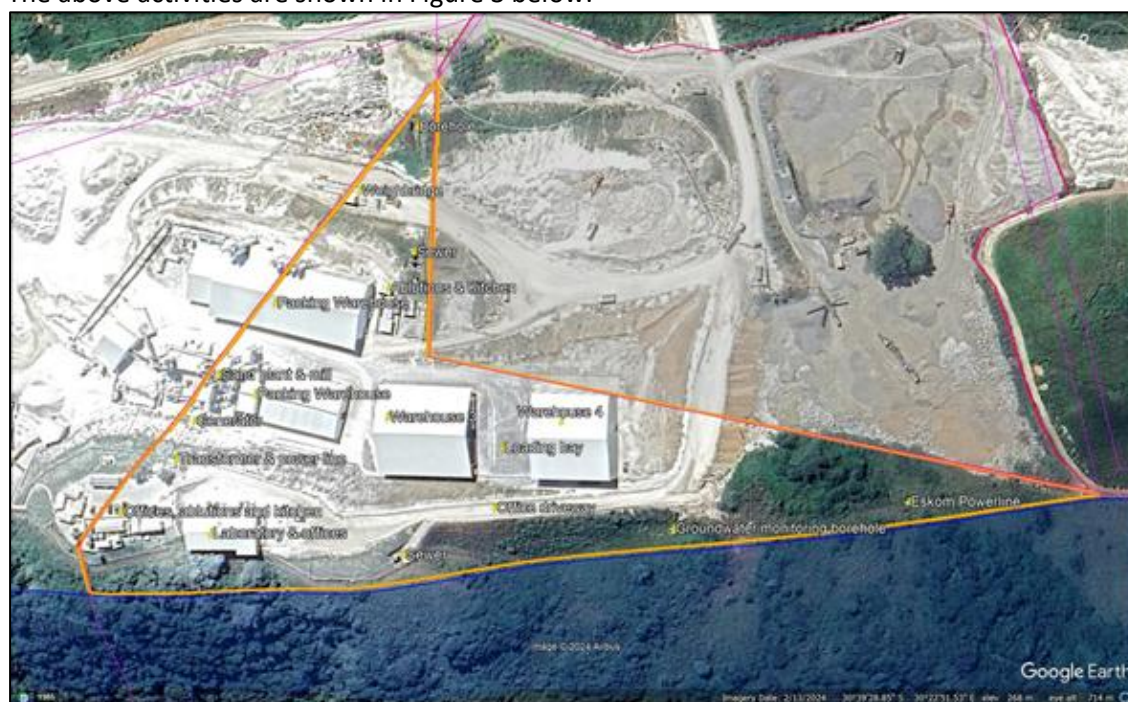
Figure 3: Mine related activities within the affected area

The above activities are shown in Figure 3 below: