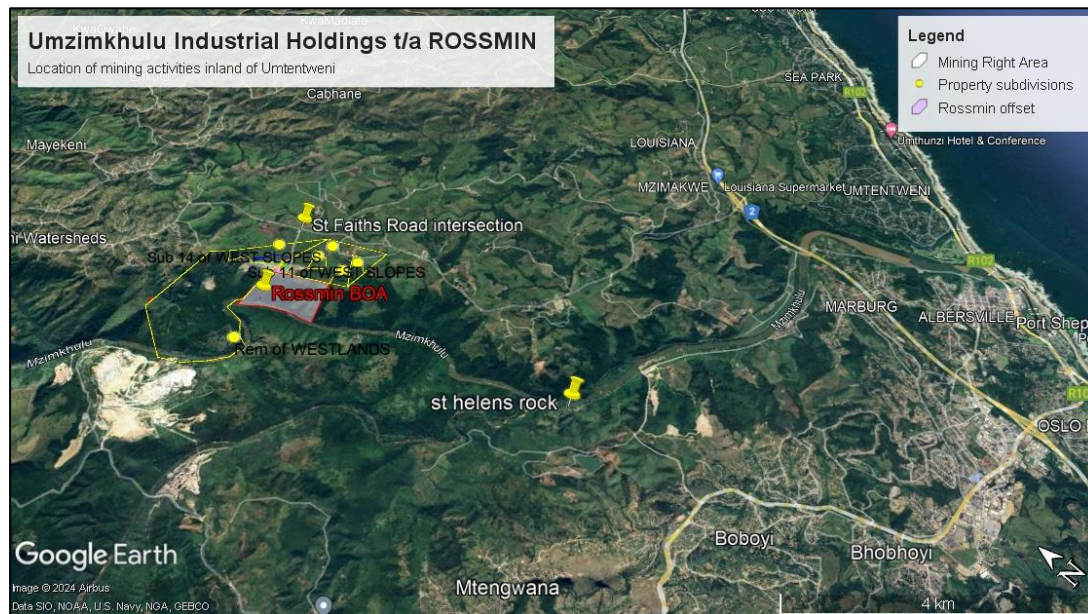
Map 1: Aerial location map of Rossmin activities

As described above, Rossmin is located northwest of Port Shepstone and inland of Umtentweni in the Oshabeni area between the Umzimkhulu River and St Faiths Road: