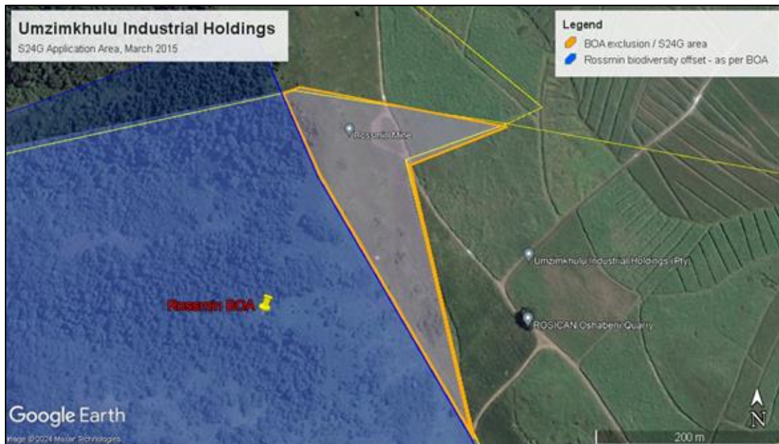
Figure 2: Part of Remainder of Farm West Slopes No 5828 ET that was excluded from the biodiversity offset area

Although all the necessary approvals were in place for the mining and processing operation on Remainder and Sub 2 of Farm Westlands No 5829 ET, these did not include an area of the neighbouring property Remainder of Farm West Slopes No 5828 ET that had been excluded from designation as a biodiversity offset area. (see Figure 2 below)